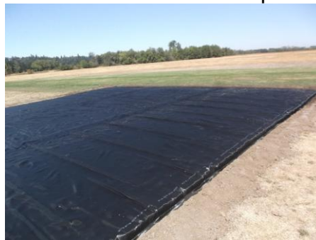
8-19 Did NOT shrink as expected