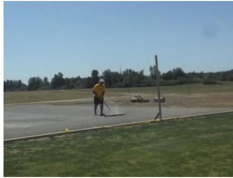
8-11 Geotext arrived