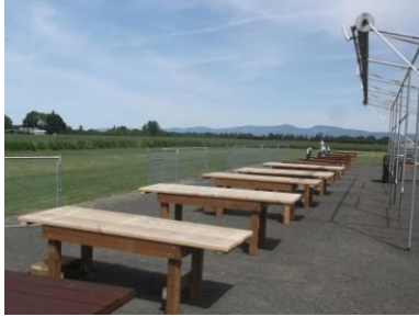
5-13 More new tables