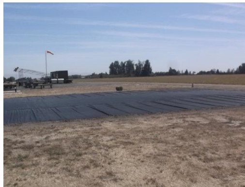
8-25 Trenched dug out and geotext stretched