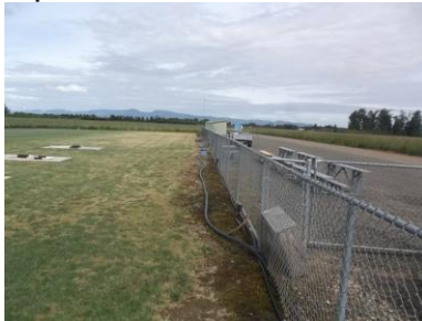
8-15 Trench for underground sprinklers