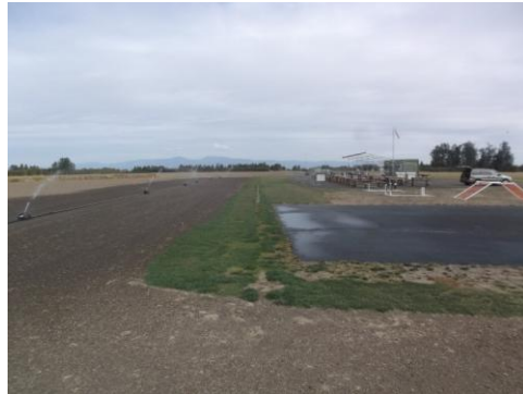
Sep 25 – watered East end of runway 2 hrs