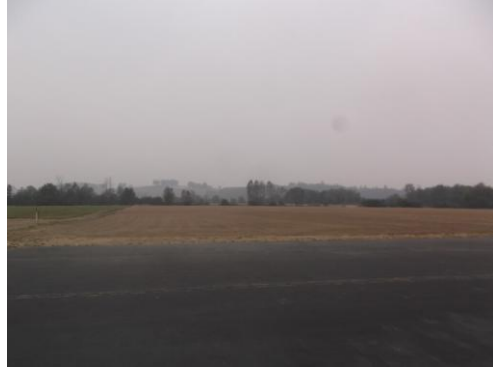
raked and rolled.