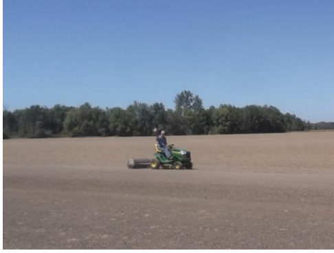
Sep 16 – Seeded,