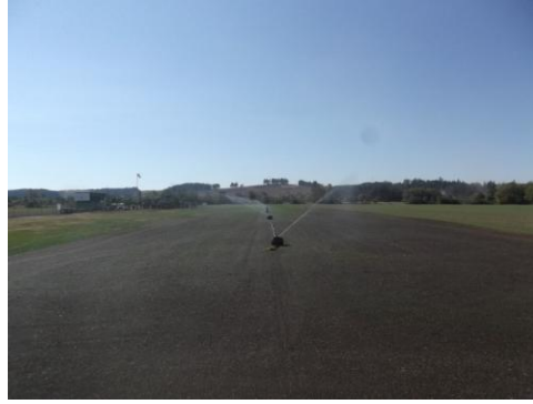
Sep 28 – Seeded and watered South East field 1 hr