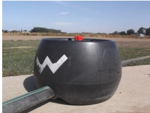
Sep 25 – watered center of runway 2 hrs