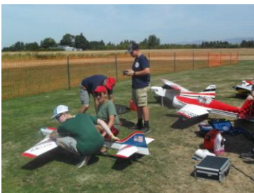
Getting Zeus ready