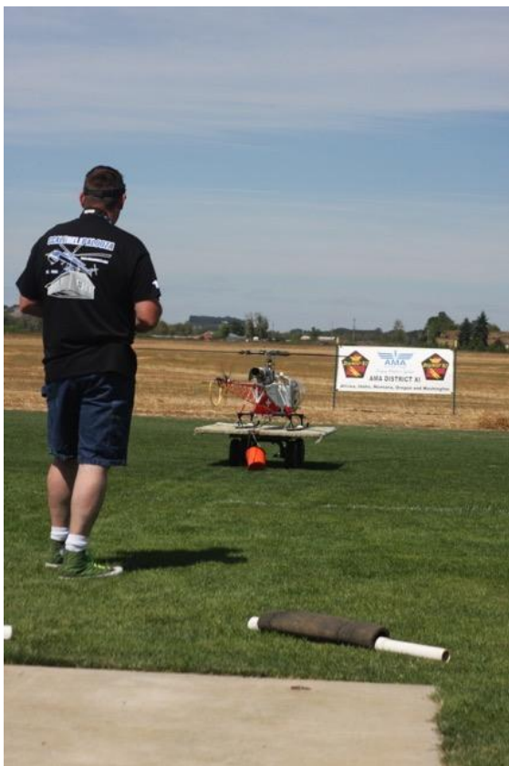
Takes off from trailer