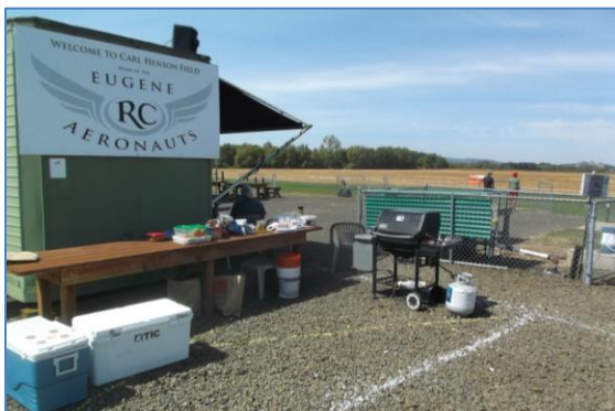
ERCA's burgers and dogs lunch