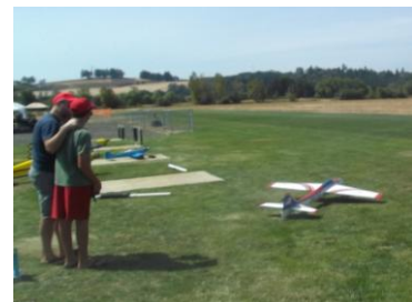
Zeus is ready