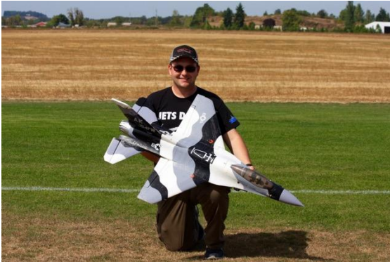
F16 - ducted fan that sounds great!