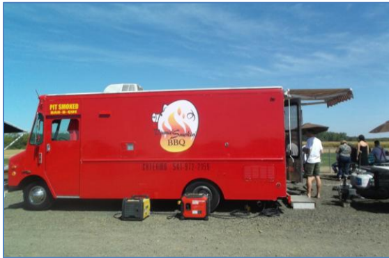
Vinnie's Smokin BBQ 541-972-2159