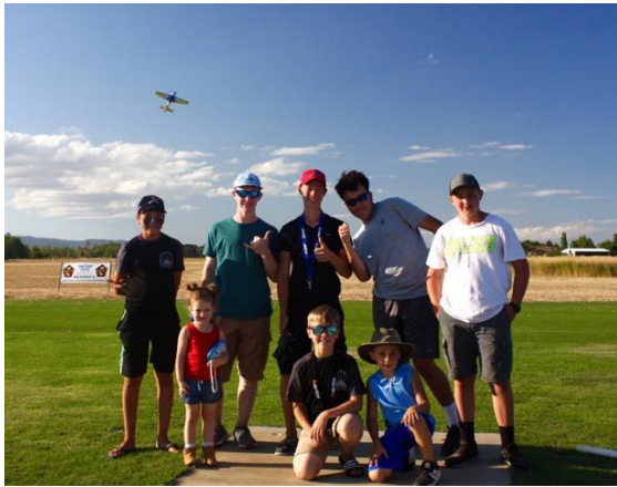
Not all RC flyers are OLD