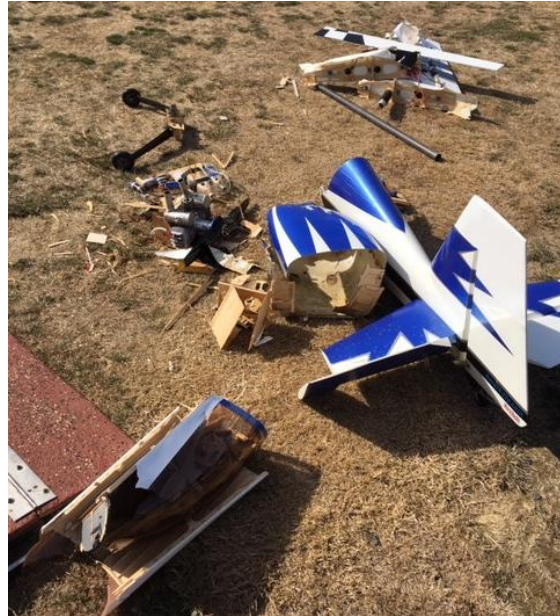
Worst crash award