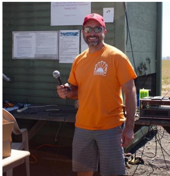
Assistant Event Director