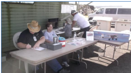
Pilot sign in and raffle ticket sales