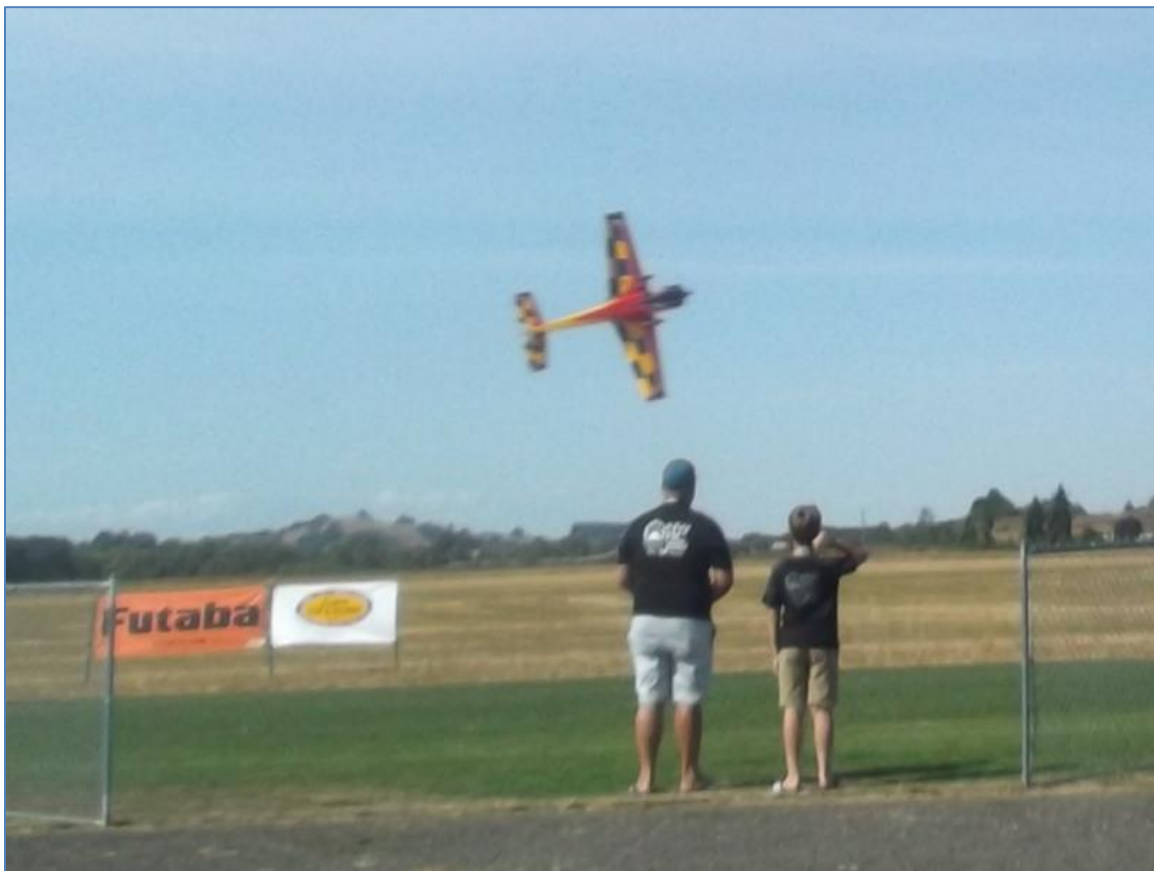
Tim and Timmy's flying are always a crowd pleaser.