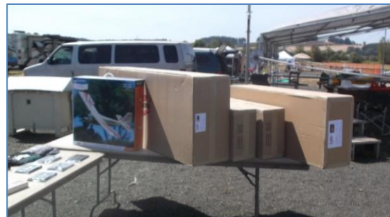
Prizes for raffle