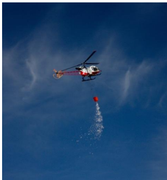
Dumps it... is that cool or what?