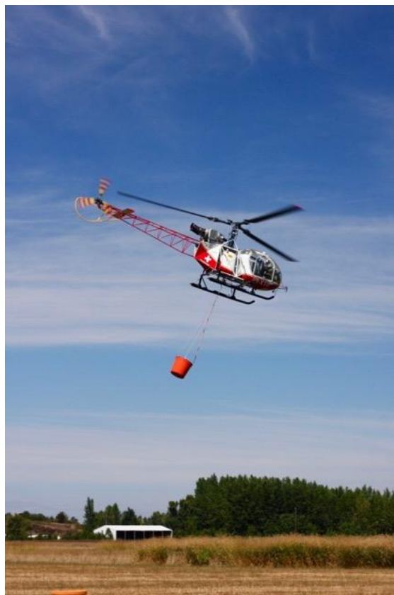
Hauls a bucket full of water